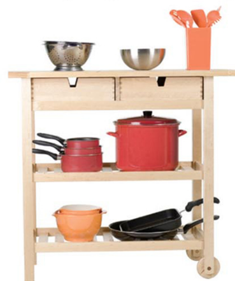
Homes & Land

Islands create the perfect space for casual dining, chit-chatting while entertaining or for the kids to tackle homework. Consider styles of seating as you contemplate your island approach.